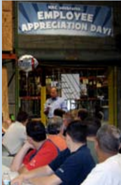
Employee Appreciation Day