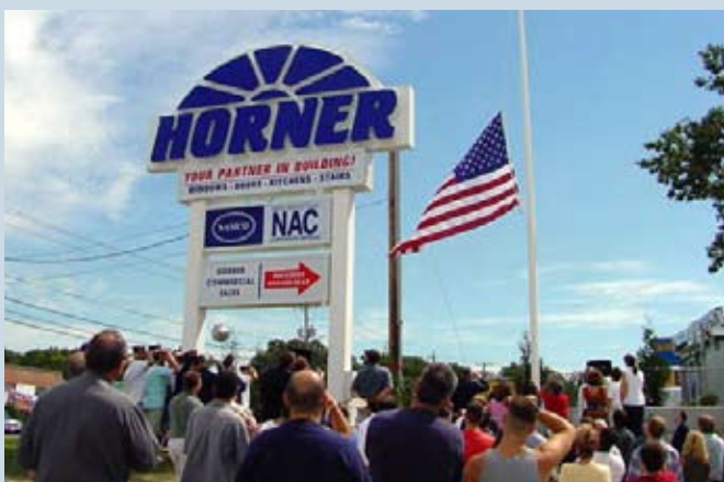
Flag Raising Ceremony, September 10, 2002