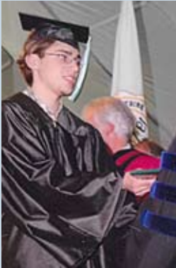
NAC Scholarship Fund